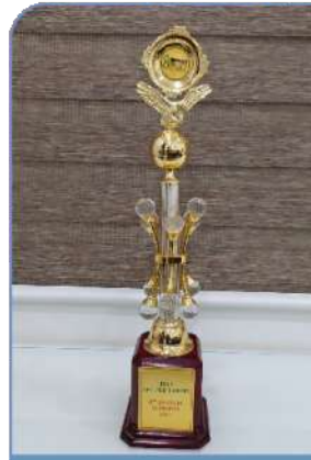
AIMS Won 'Best College Trophy' In 8th Guj. State Conphys In 2014 (at State Level)