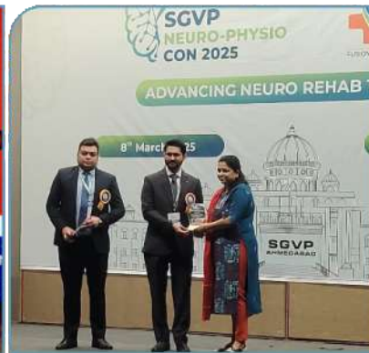
Appreciation Award To AIMS at SGVP Hospital- Neurophysio Conference 2025