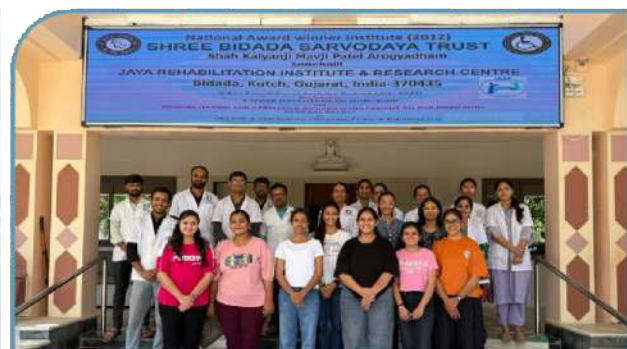
Institutional Visit at Jaya Rehabilitation Centre Bidada