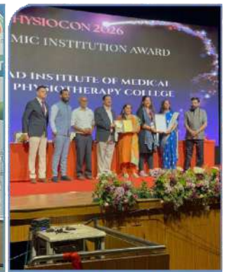
AIMS Was Awarded As Best Academic Institution Award In JG Physiocon 2026