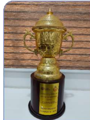
AIMS Won 'Best College Trophy' In Guj. State Conphys 2018 and Best Student Award to Student Of AIMS