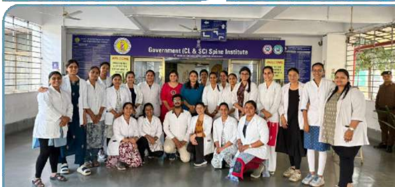
Government Spine Institute, Ahmedabad