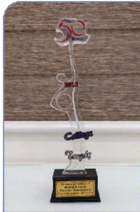
AIMS Won 'Best College Trophy' In 2012 At National Level Conference By Indian Association of Physiotherapists, In Student Forum