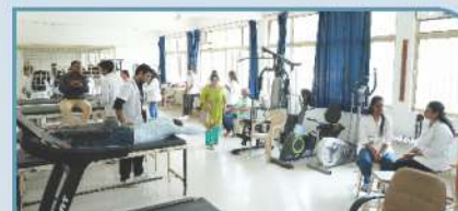
EXERCISE THERAPY & KINESIOLOGY LAB