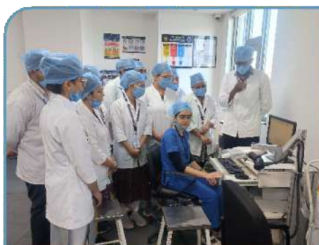
U N Mehta Institute Of Cardiology and Research Centre, Ahmedabad.