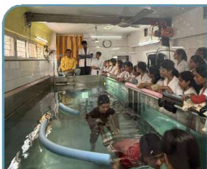
Sparsh Pediatric Rehabilitation Clinic, Ahmedabad