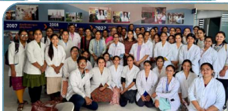
Hiramani Aarogyadham Ahmedabad