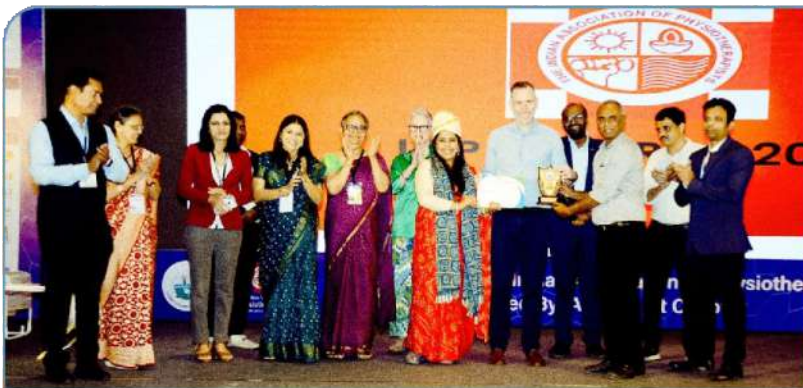
AIMS Was Awarded For Best College For Campus Placement At 60th Lap National Conference 2023